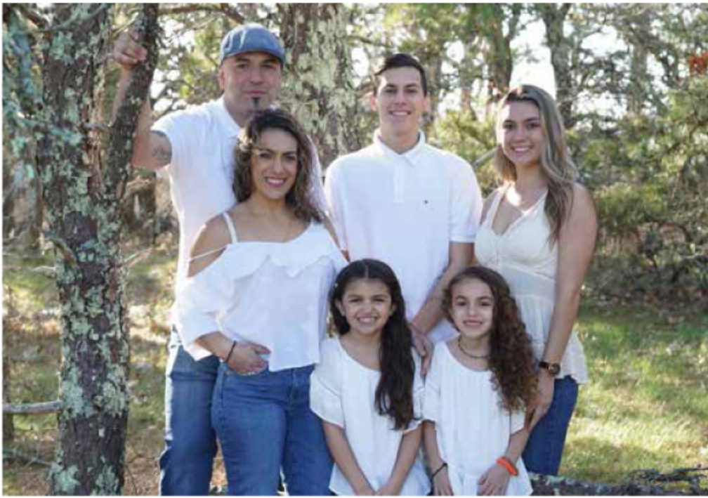
The Sarras Family